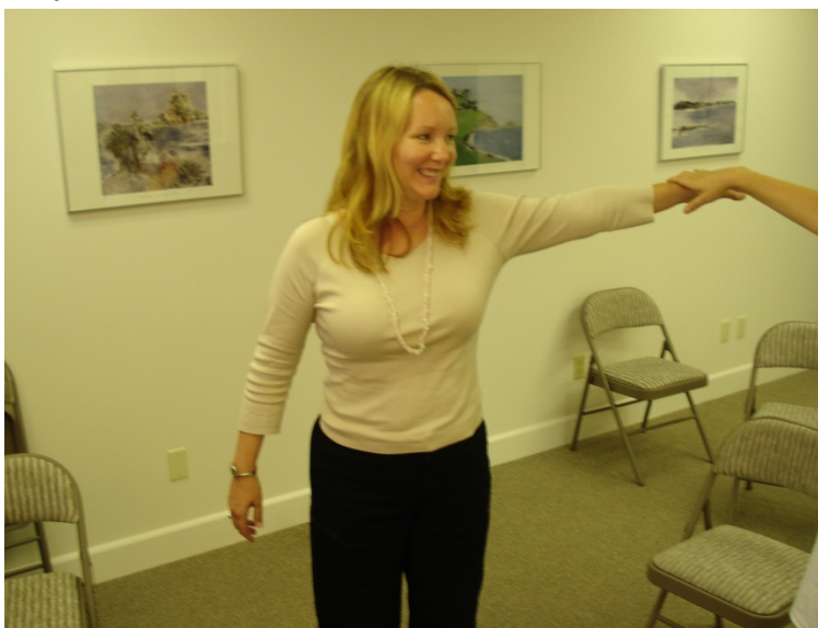
Muscle testing, weak field

But, when she says “ I am a man ”, this causes her field to become weak, because