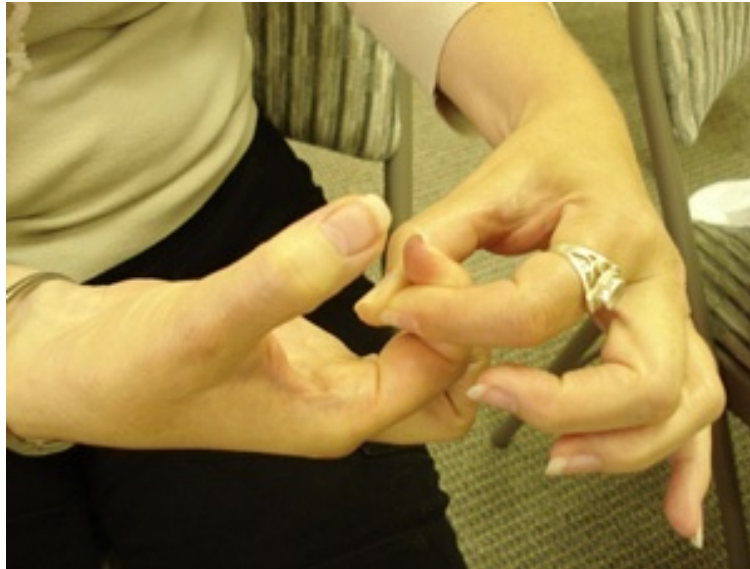
Finger ring test, false result

Advantages of the finger ring test include: