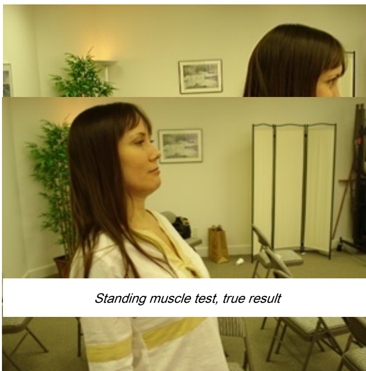
Standing muscle test, true result

Next, rebalance yourself, and say “NO” – you should feel yourself tilting