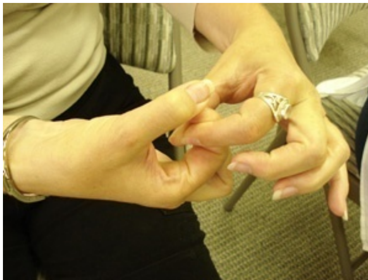
Finger ring test, true result

The finger ring test is a popular form of muscle testing because it requires very little energy and puts little or no strain on the body. The ring test can also be done on yourself, or with a partner. The instructions below will describe how to use the finger ring test to test yourself; if you wish to use this test with a partner, the only difference is that your partner will pull apart your fingers instead of you doing it yourself with your other hand.